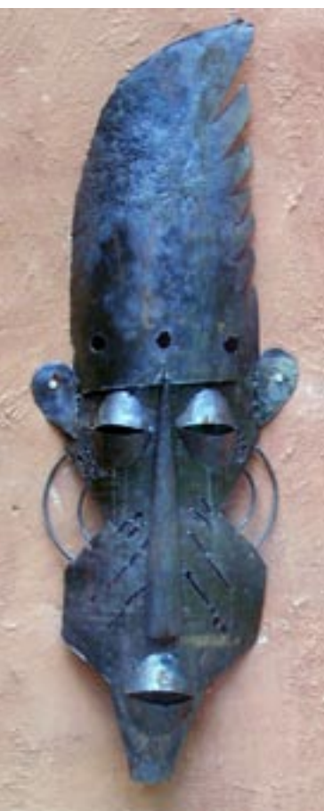
an ape mask adds atmosphere