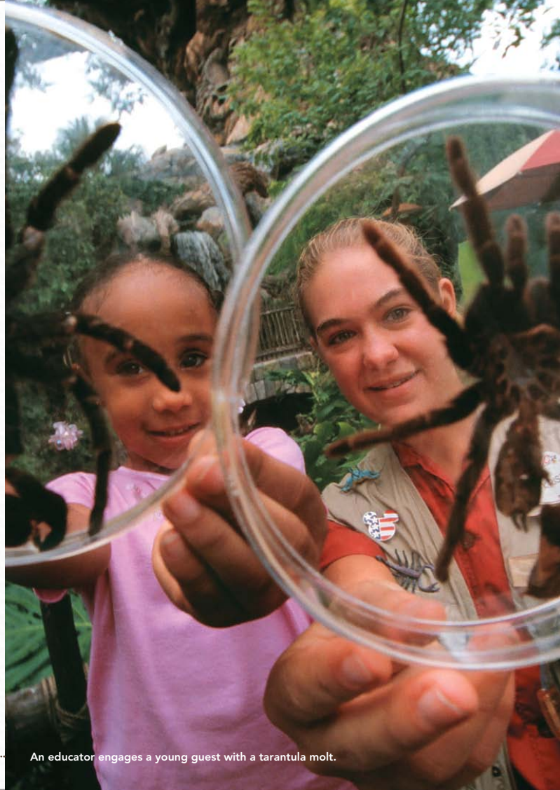
An educator engages a young guest with a tarantula molt.

Kids' Discovery Clubs at Disney's Animal Kingdom engage young guests 5–8 years old in wildlife activities. Staffed by the education team, each of the six clubs provide an activity and positive action children can take to help wildlife. On average, the educators talk to over 1.5 million guests a year.