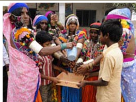
Parents participating in hand washing camp.