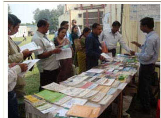
Teachers at CEE stall.

CEE North was invited by the Institute of Environment and Sustainable Development (IESD), Banaras Hindu University (BHU), Varanasi for the '6th National Teachers Science Congress' from 8-11 November. More than 300 teachers from all over India, 200 students and young visitors from Varanasi attended the Congress.