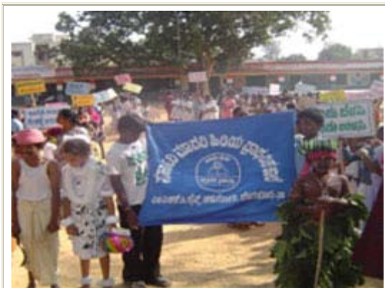
Awareness rallies are a good way to spread the message.

'Forests for Sustainable Livelihood', the theme for the 2011-12 NEAC programme, is aimed at sensitising citizens about the importance of forest conservation. Some of the components under this theme include protection to sacred groves, promotion of bio-farming, promotion of the use of eco friendly and organic products, revival of traditional herbal remedies, promotion of alternate energy sources, to name a few. The theme is important considering the United Nations General Assembly declared 2011 as the International Year of Forests to raise awareness on sustainable management, conservation and sustainable development of all types of forests.