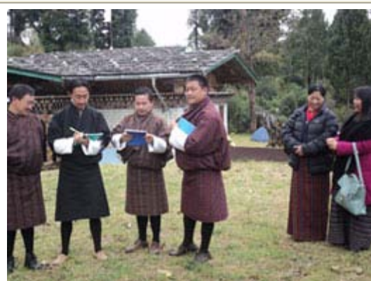
Teachers identified numerous curriculum-linked teaching opportunities in the Park.