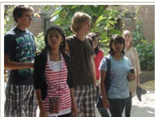
MUWCI students enjoying the CEE campus.

A group of 11 students and 2 faculty members from the Mahindra United World College of India (MUWCI) visited us here at CEE, Ahmedabad! The Mahindra United World College of India (MUWCI) is one of 13 United World Colleges. This year's batch of students is 200 strong.