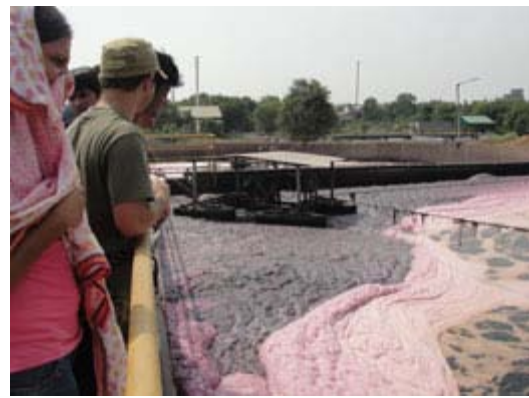
Management students at Common Effluent Treatment Plant (CETP) at Naroda.

Industries often require environmental managers to ensure that environmental 'obligations' are met and rules and norms are adhered to. Various management organizations have also included environment management as a core subject in the syllabus and provide training to students through industrial visits.