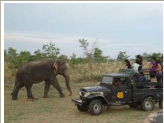
Time to stop and stare!

conserving the tropical forest which is a biodiversity hotspot. Sigiriya's Lion's Rock and spotting elephants, langurs, monitor lizards, and many endemic birds in Minneriya National Park were the other highlights of the camp.